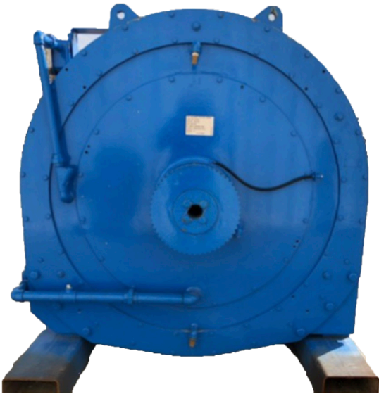
BAYLOR EDDY CURRENT BRAKES