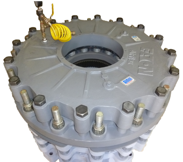
WATER COOLED BRAKES